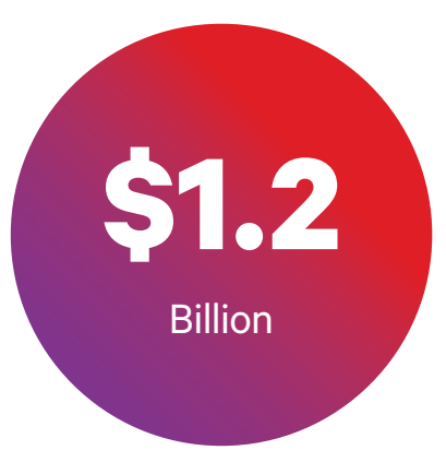
New Capital Investment